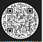
Scan to visit our website

The Ministry Center Office will be closed on Wednesday, Dec 31st, and Thursday, Jan 1st for the New Year Holidays!