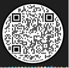
Scan to visit our website

Office Hours Tuesdays and Thursdays: 10am—2pm Wednesdays: 9am-11am Please call before coming to make sure someone is in the office.